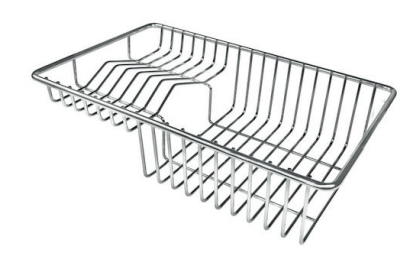
Stainless steel plate rack 8100 303 * only in combination with the accessory 8644 101