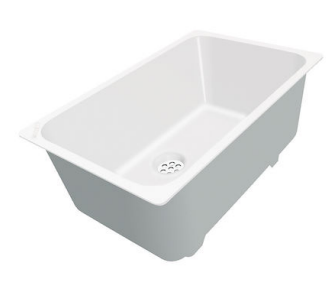
White bowl 8153 100