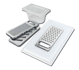
Graters kit with ring-holder and food collection tray