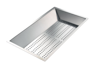
Stainless steel perforated tray

* only in combination with the accessory 8644 101